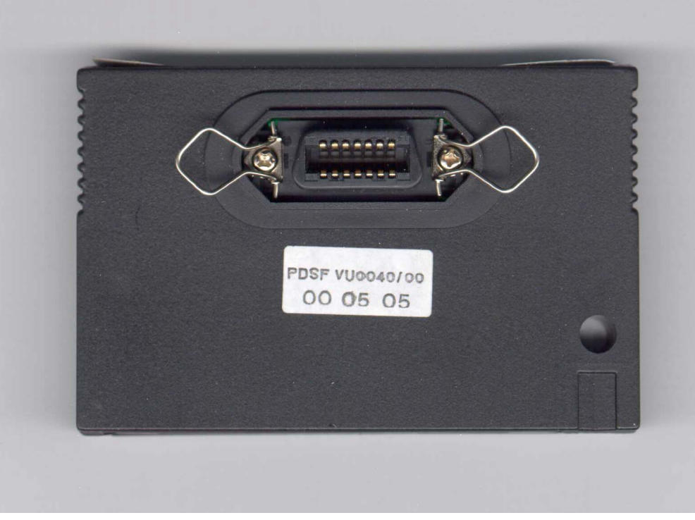
Written, scanned and converted to PDF by HansO, 2001