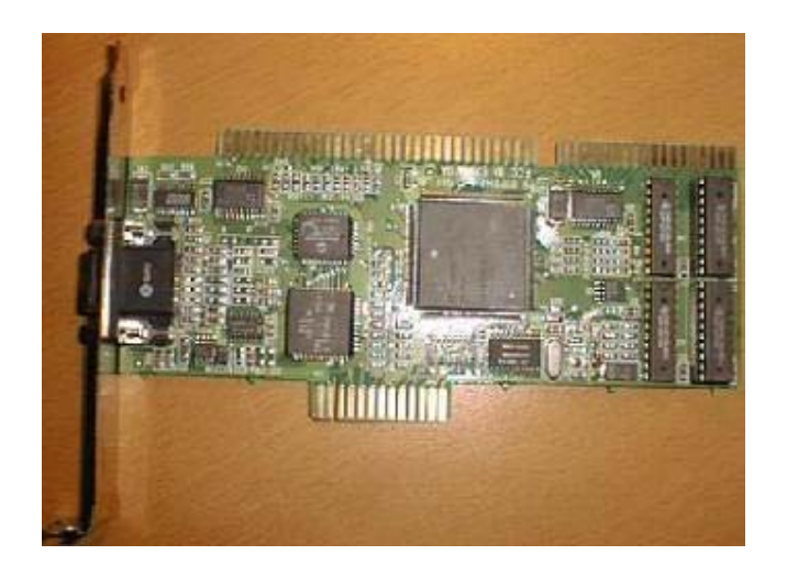
ATI ISA SVGA board from circa 1991

I got my DRAM chips from an old SVGA board from local electronic junk store. It was 8 CA$, which is about 5.5 US$ or 4 euro.