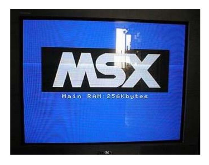
This is all you need to do for a 256KByte upgrade!

If you want to get full 512KBytes of memory, follow the rest of the steps.