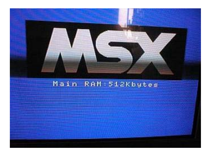
All done! If you did everything correctly, you'll get full 512KBytes of RAM in your MSX2+ computer. This is enough to play english disk version of Metal Gear 2 with SCC sound.

Desolder T9769 pin 51 and connect it to pin 52 (+5V). Solder a wire from T9769 pin 50 to pin 17 of both "second flour" 44256 chips.