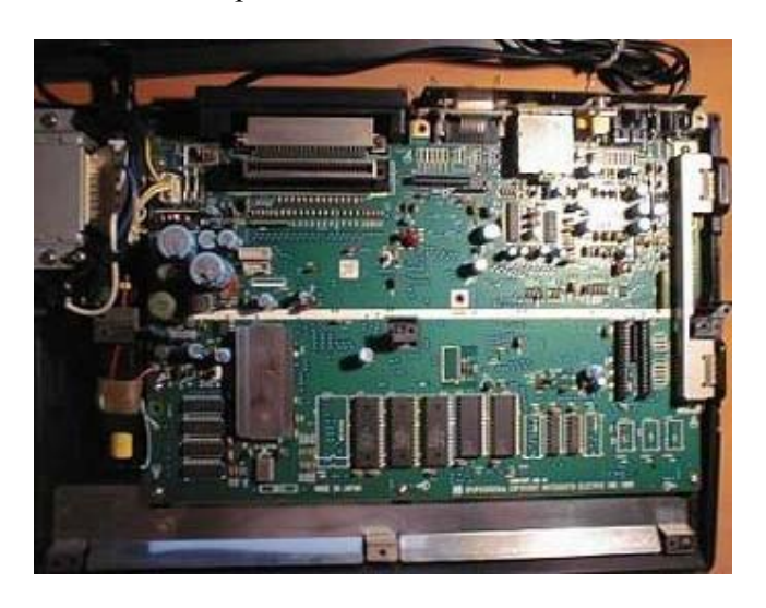
Panasonic FS A1WSX PCB

Desolder 4464 DRAM chips from IC22 and IC23 and capacitors from C89 and C90 (you can use 4164 chips to upgrade your VRAM to 192KBytes or expand SCC+ cartridge from 64 to 128KBytes). Put those capacitors in C88 and C91 and 44256 DRAM chips in IC21 and IC24 positions.