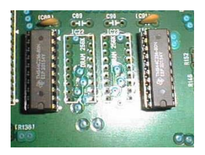
2 x 44256 DRAM chips after upgrade

Look for the T9769 chip (MSX engine) of the other side of PCB. Next to it you will find two jumpers: J3 and J2 (R140 and R141 for WSX PCB). Desolder resistor from J2 (R140 on WSX). Short J3 (R141) with a small piece of wire to get +5V on T9769 pin 52.